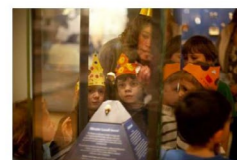
Volunteering with Visitors

Please note: the Volunteer Service does not organise work experience, work placements, or internships.