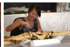
Volunteering Behind the Scenes