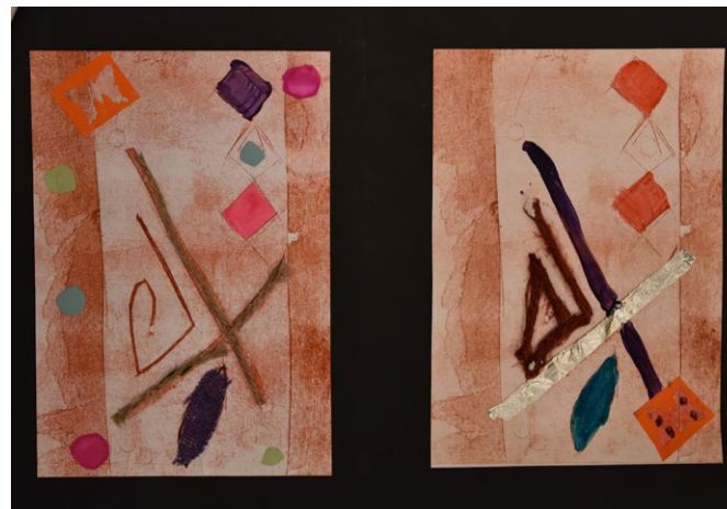
Collograph plate and Print – A collograph plate and resulting print

The project has been intense in many ways but rewarding for all involved. It has the double benefit of a qualification-based outcome and supporting pupils to develop crucial life skills (communication, travelling to a venue out of school, meeting adults who are new to them, reflecting on learning and skill development). More able and confident students (along with an adult) caught the bus to visit the museum – reading timetables, counting change and finding the bus stop are core skills delivered within a context of access. A further desired outcome is that at least one young person (a female student with communication and interaction difficulties) has