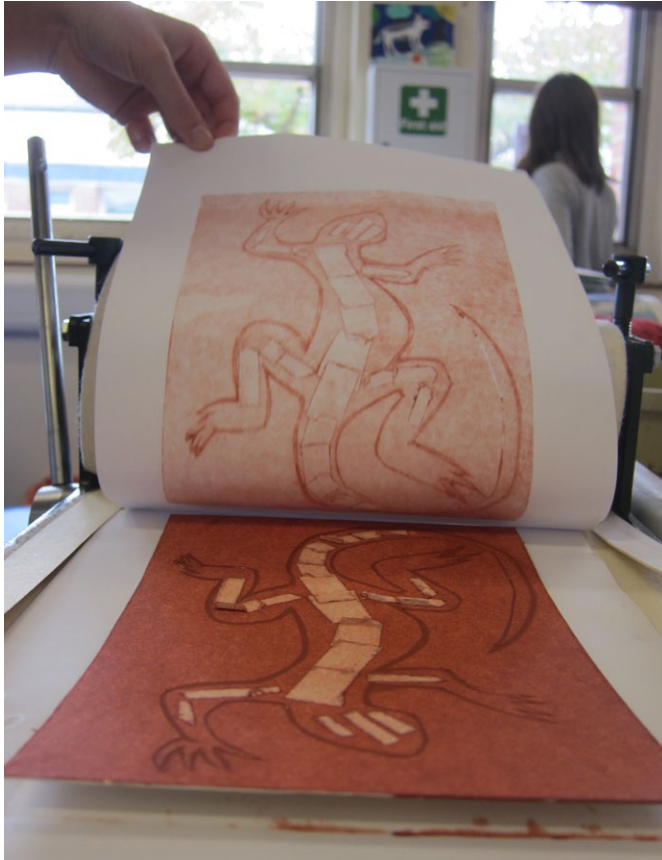
Print and Press – A collograph emerging from the printing press