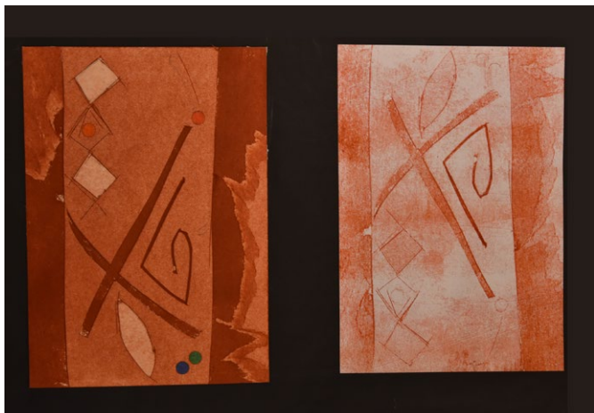
Collograph plate and Print – A collograph plate and resulting print

new adults cannot be underestimated. Careful planning mitigates this risk as does building a relationship with a trusted adult at the museum, in this case Katherine Rose.