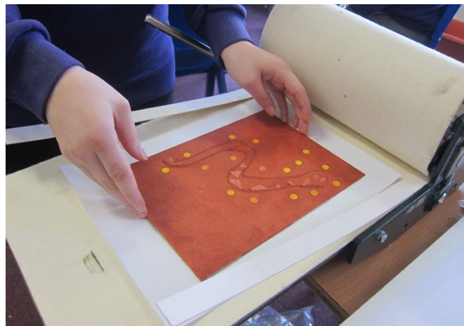
Students learnt to use the printing press independently

The pooled expertise of the professionals involved has also been key to success. The museum staff brought knowledge of Arts Award and the Pitt Rivers collection and the teaching staff brought knowledge of their pupils, appropriate pedagogy and experience of working with evidence-based assessment. This not only enabled shared project design and planning, but ensured successful delivery of the collaborative project.