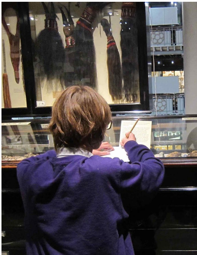
Pupil from the Iffley Academy drawing on a visit to the Pitt Rivers Museum

young people who have additional access needs. By looking closely at the needs of groups of learners the Arts Award criteria can be broken down to enable the most logical and beneficial methods of evidence collection as well as allowing careful consideration of which artefacts and areas of the collection are the most inspirational and relevant to work with.