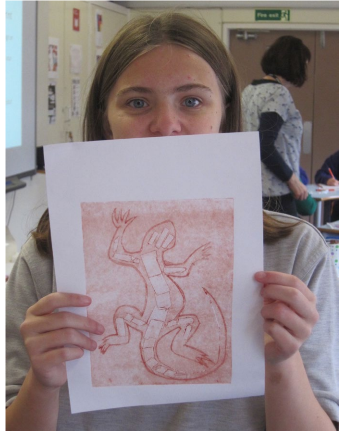
Pupil showing her successful collograph print

The Iffley Academy is an ideal school to work with because teaching is structured around a termly theme, with one class teacher responsible for all teaching throughout the day. This topic-based approach enables the school to meet the additional and multiple needs of pupils. There were