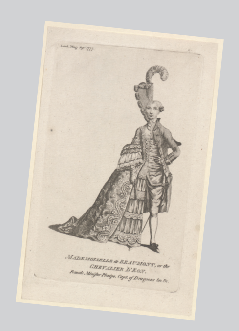
Image: Mademoiselle de Beaumont, or the Chevalier d'Éon, London Magazine, September 1977

The Bodleian Libraries' Special Collections are a treasure trove of archives, manuscripts, rare books, printed ephemera, maps and music, which date from the present day back to ancient and classical antiquity, and many were created by or of importance to LGBTQ+ people.